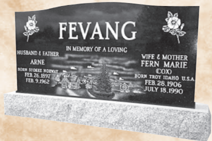
Design: 98 Fevang (Etched)