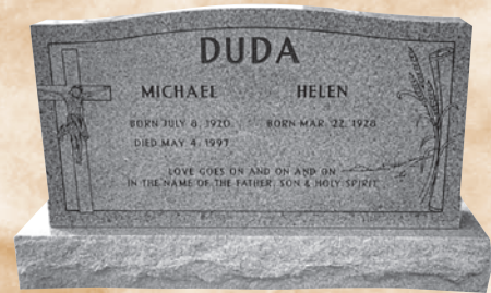
Design: 98 Duda