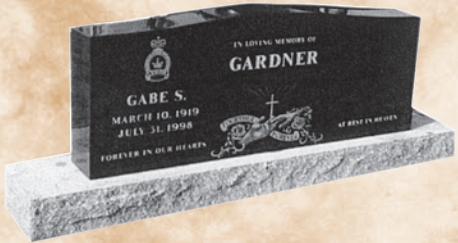
Design: 99 Gardner