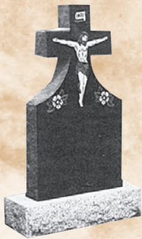
Design: P.C.M. 10 Standard Cross